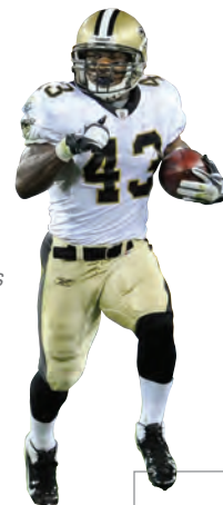
New Orleans Saints, Nov. 28

Nov. 28. New Orleans Saints vs. New York Giants; Louisiana Superdome. Information, NewOrleansSaints.com .