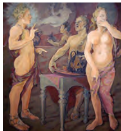
"Dureau," through Jan. 3

THROUGH JAN. 3. "Dureau"; Ogden Museum of Southern Art. Information, OgdenMuseum.org .