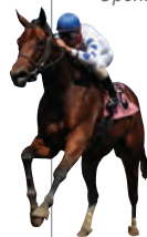
New Orleans Fairgrounds Opening Day, Nov. 24

NOV. 24. Opening Day (horse racing); New Orleans Fair Grounds. Information, FairGroundsRaceCourse.com .