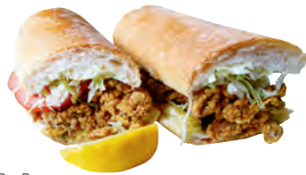
Po-Boy Preservation Festival, Oct. 2

NOV. 20. Po-Boy Preservation Festival; Oak Street. Information,